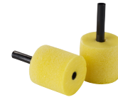
Eartone 3A foam eartips adult medium