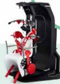
TRV Chair Diagnosing and treating Benign Paroxysmal Positional Vertigo (BPPV)