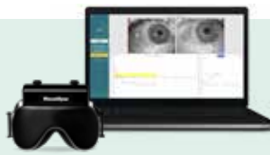
VisualEyes™ 525 Complete VNG solution for balance assessment