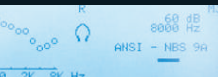
Manual Audiogram result.