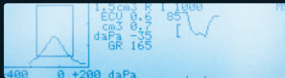
Sample 226 Hz Tympanogram and 1000 Hz Ipsi Reflex result.