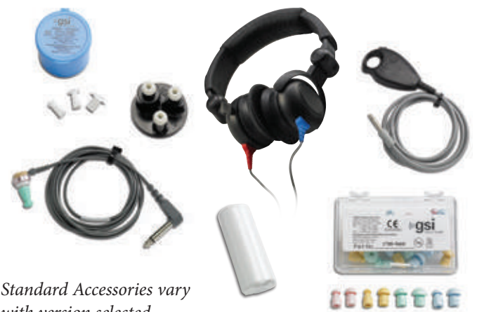
Standard Accessories vary with version selected.