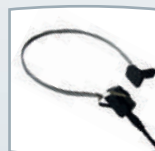
BC headset B81