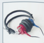
AC headset TDH39