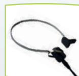
BC headset B71