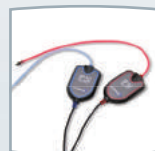
Insert phones IP30