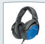
AC headset HDA300