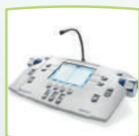
MA 41 with gooseneck micro