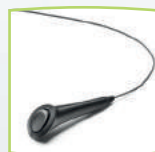
Patient response switch