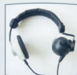
BC headset BKH 10-3