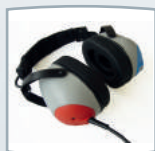
AC headset Holmco 8103