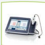
touchTymp with printer