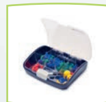
Ear tip kit