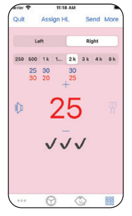
Manual Test Mode