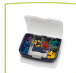
Eartip box with eartips