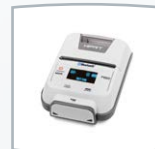
Wireless thermal printer HM-E200