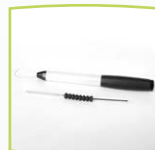
Probe cleaning kit