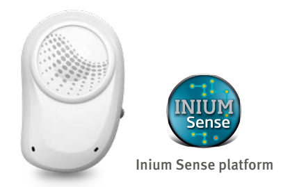
Ponto 3 SuperPower

Ponto 3 SuperPower is the most powerful abutment-level device on the market. Results show that a significant decrease in listening effort can be achived with the Ponto 3 SuperPower, as indicated by reduced pupil dilation.<sup>3</sup>