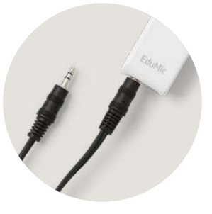
Use the 3.5 mm audio jack to stream sound from a computer, smart board or tablet directly to the child's hearing aids.