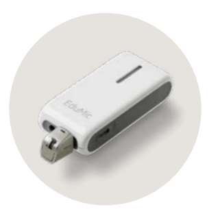
EduMic links Oticon hearing aids to existing remote microphone systems in the classroom using a standard Europin connector.