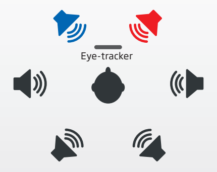
Figure 1. Test setup with a total of six loudspeakers, which is identical to the setup used in the Oticon More EEG study (Santurette et al., 2020). Pupillometry was done by placing an eye-tracker in front of the participants to measure sustained listening effort. Two frontal loudspeakers (blue and red) contained a male and a female talker reading audio clips simultanouely. Background noise, which is a 16-talker babble, came from the remaining four loudspeakers.

A common challenge among people with hearing loss is the effort it takes to listen. They often complain about being "exhausted" or "drained" from listening in noisy environments. Previous studies reported that even a mild hearing loss could lead to increased listening effort (Rabbit, 1991; McCoy et al., 2005). This happens because when hearing is compromised, the auditory system becomes more vulnerable to noise and disturbing sounds. The brain needs to work harder to hear in noise, which leads to tiredness and exhaustion. Indeed, researchers have found that people with hearing loss needed more time at the end of the day to rest and to recover from work (Nachtegaal et al., 2009).