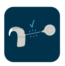
Antenna cable pull - 35 N (3.5 kg)