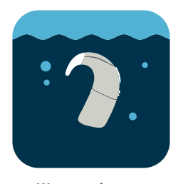
Water resistance – 1 metre for 30 min.