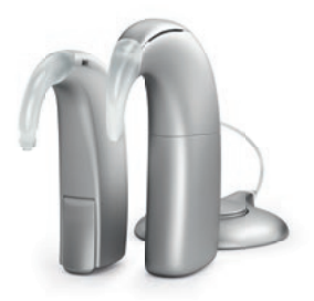
Figure 6: Neuro 2 with Oticon Dynamo

The Oticon Dynamo hearing aid covers most users' need for power and gain, giving the clarity they need. Embedded in Oticon Dynamo, Speech Guard delivers high-quality sound while preserving the dynamic variations in intensity and the nuances of the speech signal to support the users' brain in making sense of sound. In severe-to-profound hearing losses, this is even more crucial because every single speech cue counts. Oticon Dynamo and the Neuro 2 cochlear implant (Fig. 6) can both be controlled wirelessly via the Oticon Medical Streamer XM, which additionally provides a dedicated bimodal connectivity solution, compatible with virtually all Bluetooth<sup>®</sup> devices.