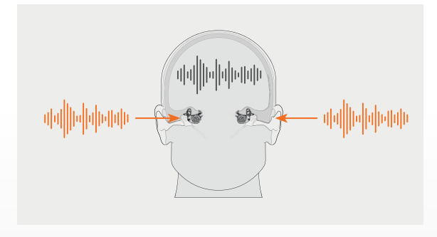
Figure 1: Binaural summation

Two heads are better than one for big ideas and problem solving, and two ears are definitely better than one when it comes to processing sounds. In a concept known as binaural loudness summation, two working ears mean that the brain essentially receives double the amount of sensory input (at least for sounds coming from the front of the listener, thereby reaching both ears equally). In other words, sounds are louder and easier to detect when you can hear them with two ears instead of one and binaural hearing means using both ears to hear (Fig. 1).