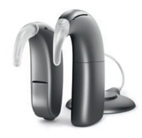
Figure 5: Neuro 2 with Oticon Xceed

Oticon Xceed targets even the most challenging severeto-profound hearing loss and gives users more access to important speech cues and more gain based on the latest technology. Like other members of the Oticon Opn<sup>™</sup> family, Oticon Xceed uses the ultra-fast OpenSound Navigator<sup>™</sup> to offer users 360° access to speech. Oticon Xceed also features the OpenSound Optimizer<sup>™</sup> that delivers optimal gain and prevents feedback.