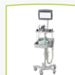
easyTransport cart tablet accessory kit option