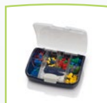
Ear tip kit