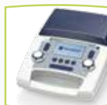
MA 28 device