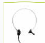
Bone Conductor B71