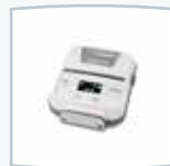
HM-E300 USB printer