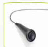
Patient response switch