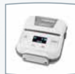
HM-E300 printer kit