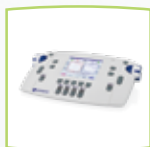
MA 42 Device