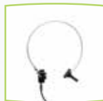
BC headset B71