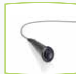
Patient response switch