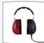
AC headset DD450