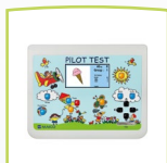
PILOT TEST device