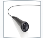
Patient response switch