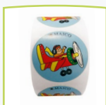
Roll of stickers