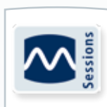
MAICO Sessions PC Software