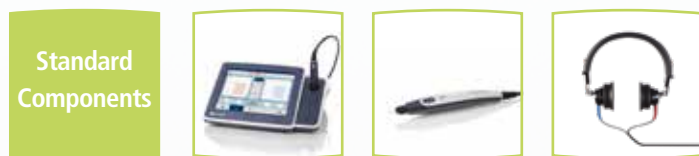
touchTym with printer

Specifications are subject to change without notice.