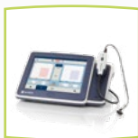
touchTym with printer