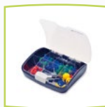
Ear tip kit